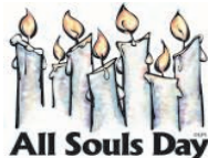
All Souls Day