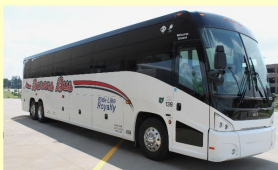
Barons Luxurious Motor Coach

If you are able and interested in helping set up and take down for the festival, please call the rectory. We will need lots of help taking down because school starts on Tuesday, September 1st!