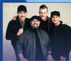
BIG DADDY WEAVE